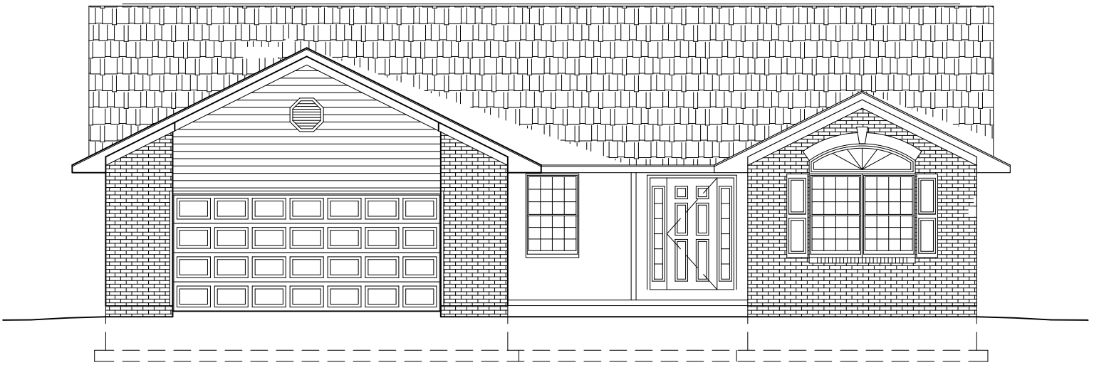
1 FRONT ELEVATION A-1